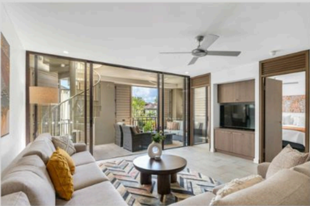
Palm Cove Triton Street