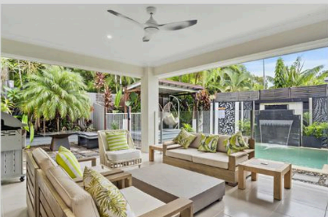
Palm Cove Litara Court