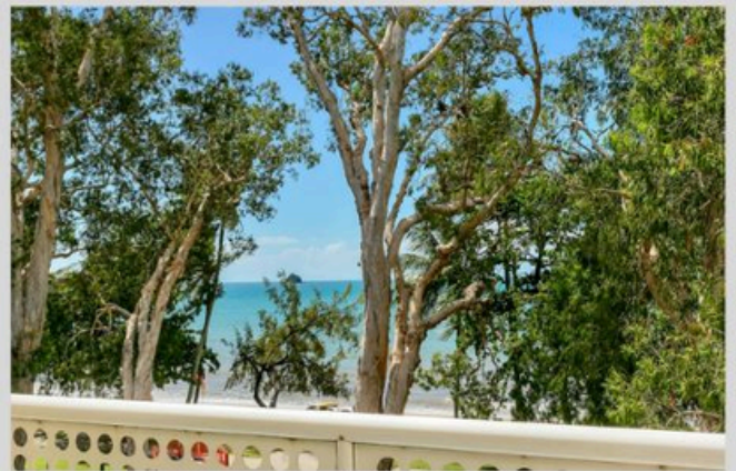
Palm Cove Williams Esplande